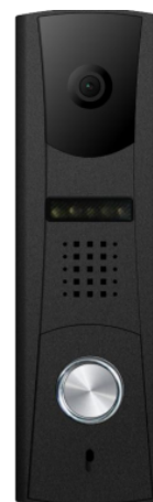
Dimensions: 40(W) 140 (H) 23 (D) mm